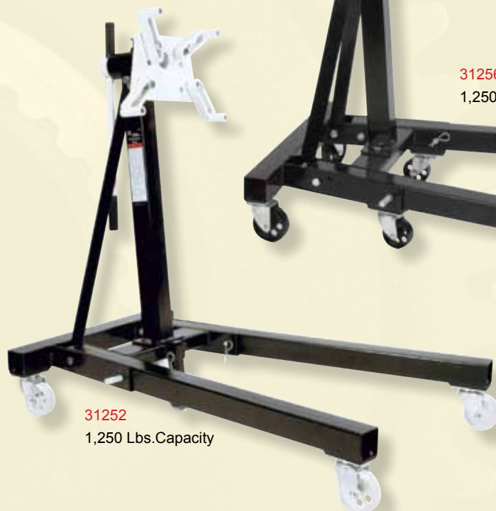
31252 1,250 Lbs.Capacity