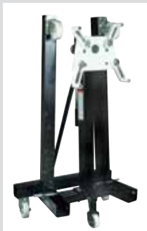
Foldable Legs (Available on 31252 and 31256)

SMOOTH ROTATION Heavy duty worm gear allows for smooth and effortless engine rotation