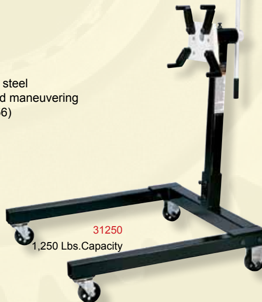
31250 1,250 Lbs.Capacity

SMOOTH ROTATION Heavy duty worm gear allows for smooth and effortless engine rotation