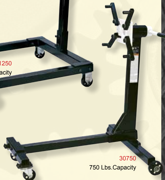
30750 750 Lbs.Capacity