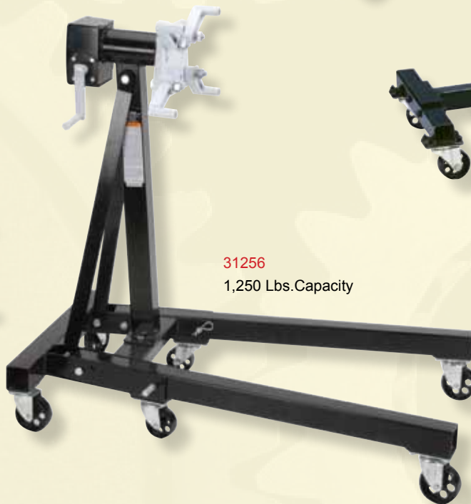
31256 1,250 Lbs.Capacity